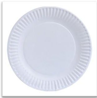
Shiny paper plates

All these items are not compostable or recyclable and are not accepted at this festival for these reasons.