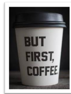
Normal coffee cups