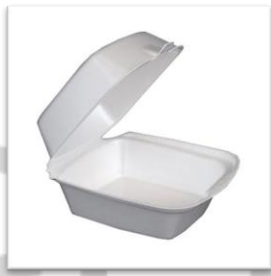
Polystyrene cups or food containers